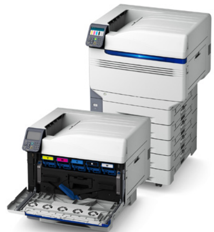
Printronix Laser Printers