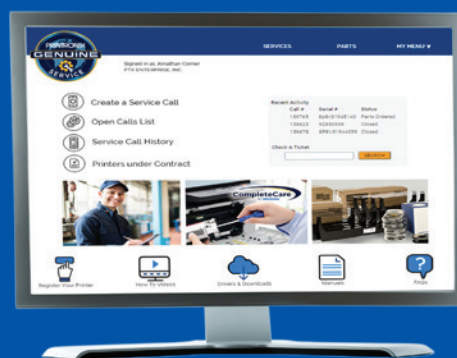
Printronix Service Portal